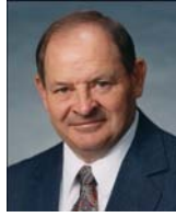
Senator Gary Dahms

“Transitioning from County Commissioner to State Legislator”